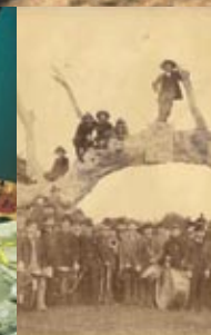
Old Gum Tree