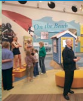
Surf, Sea and Sand