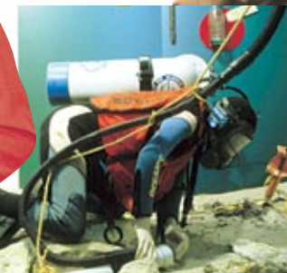
Diving into the Past