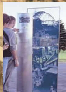
Proclamation Trail marker