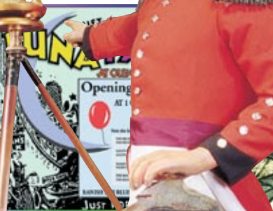
Opening of Luna Park 1930