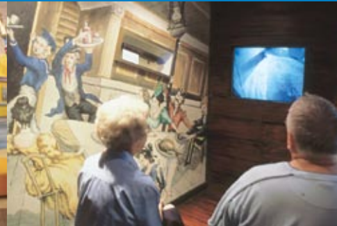
Voyage of the Africaine