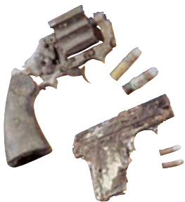
Deadly discards featured in 'Diving into the Past'

Journey aboard the Africaine as it brings the first settlers on their long voyage from England to Holdfast Bay.