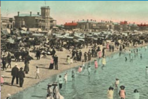
Glenelg on Commemoration Day 1936