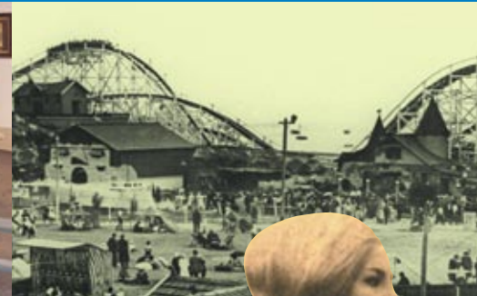
Luna Park early 1930's